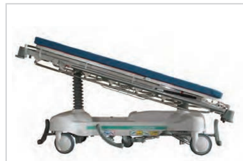
To operate HILO, Trendelenburg or Reverse Trendelenburg by foot pedal