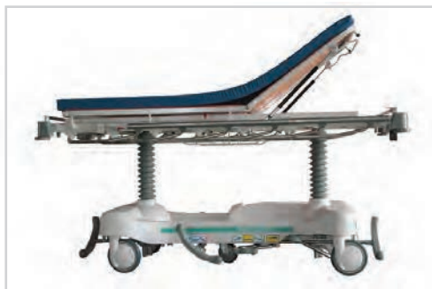
Backrest activated by gas lift & Caster Locking at 4 sides of bed